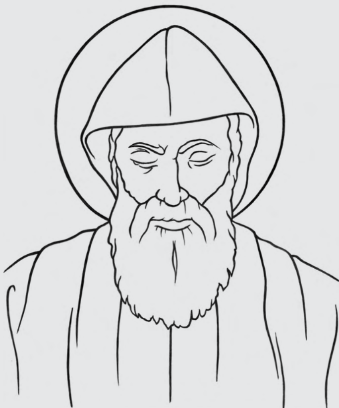
Saint Charbel