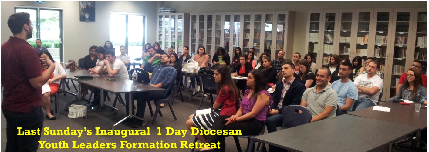
Last Sunday's Inaugural 1 Day Diocesan Youth Leaders Formation Retreat